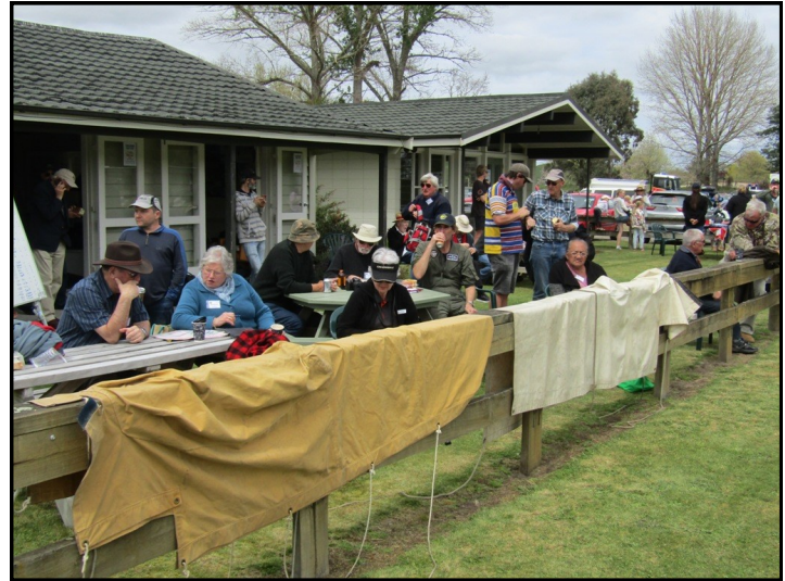
Briefing & Spot Landing