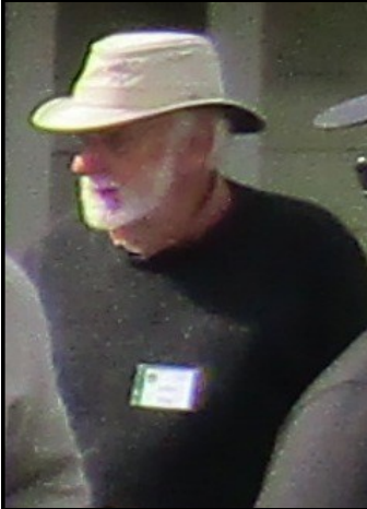
A selection of members, young and old, at Taumarunui 2020