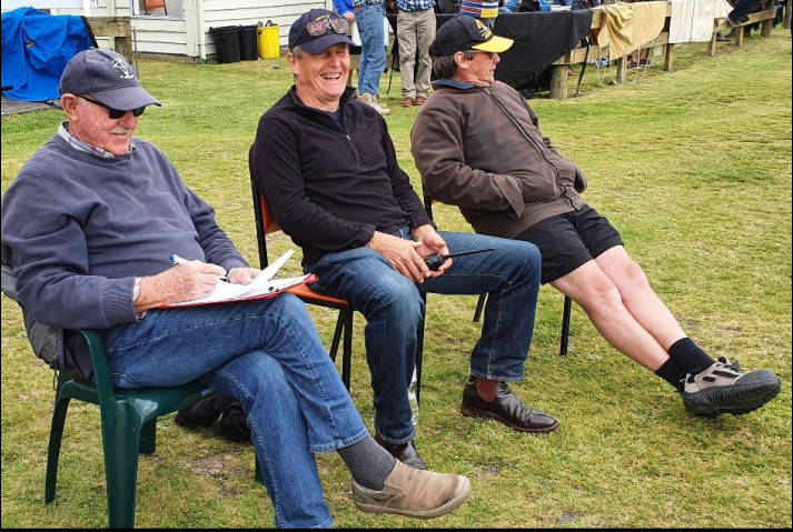
The Judges seats were fully utilised