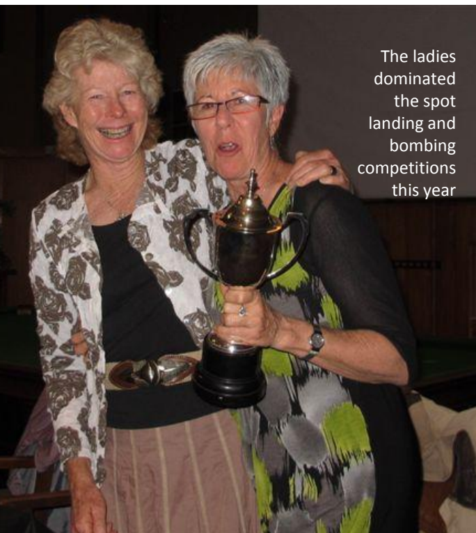
The ladies dominated the spot landing and bombing competitions this year

Unfortunately, this year is the last we will be enjoying the hospitality of the Taumarunui Club for our prizegiving dinner.